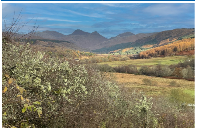
Charming, detached cottage with garden grounds set in approx. 1.35ha to include surrounding croftland

Full planning permission to extend the cottage obtained in Sept 2022