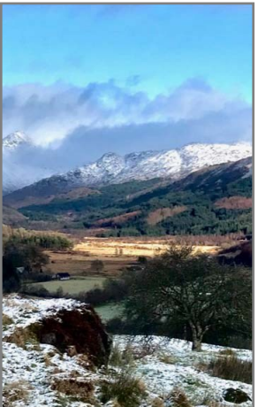
VIEWS FROM THE CROFTLAND